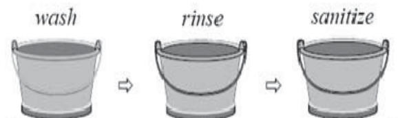
A. Water and Soap