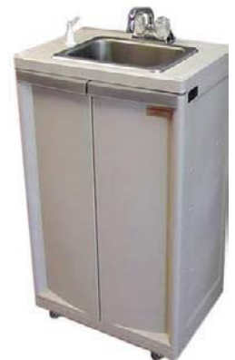
A. Pressurized Hand Washing Sink (Required for events >10 days/year)