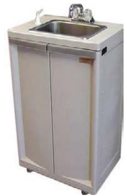
A. Pressurized Hand Washing Sink (Required for events >10 days/year)